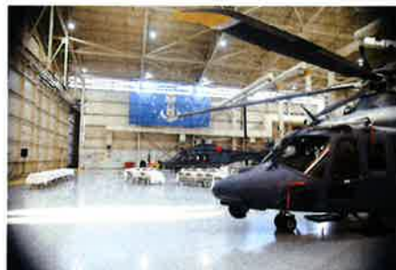
Two MH-139 Grey Wolf helicopters on display at our Veterans Day Luncheon.