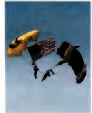
Army Golden Knights