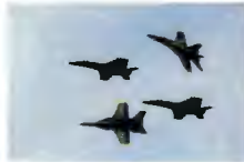
Blue Angels.

Many thanks go to our chapter and its members along with our Community Partners as we hosted a tent for the Blue Angels families and friends, DVs and others which provided a wonderful respite from the sun and perfect seating to watch a great show.