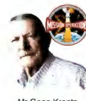
Mr Gene Krantz

The Gathering of Eagles (GOE) is the highlight of each class at the Air Command and Staff College (ACSC). This yearly event began back in 1980 when Lt Col Paul Tibbets, the Enola Gay Pilot, visited the school to speak about his experience dropping the first nuclear bomb. The students response to hearing his story was overwhelming, and so the annual event was started.