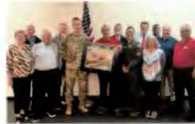
Chapter 102 members were recognized with a litho from Maxwell AFB leadership for their support of the Air Show