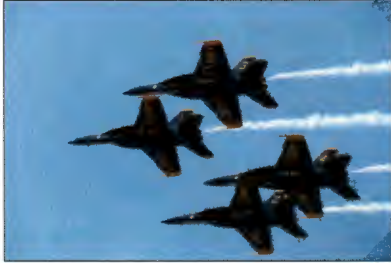
Blue Angels.

Hopefully, most of you had the opportunity to see the Air & Space Show at Maxwell AFB on April 6-7, 2024 with nearly perfect weather. It would seem many of you did as the attendance was estimated to be nearly 200,000 people attending either in person or on line. The show was spectacular with the Blue Angels being the headline show. This was the first time that the Blue Angels have come to Maxwell and it was also in conjunction with Montgomery's Navy Week events.