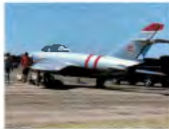
MiG-17 preparing for flight