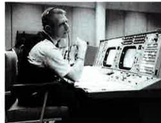
Mr. Gene Kranz