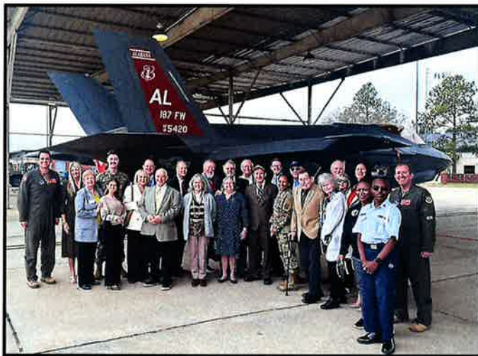
Attendees at the Annual AF Issues Luncheon got a tour of the F-35A